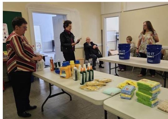
Filling the Buckets